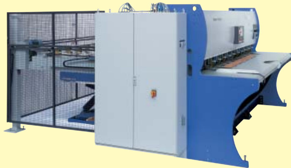
Crossmaster with immediate stacking system