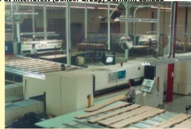
Crossfeed splicer at Interforest (Danzer Group) Durham, Canada