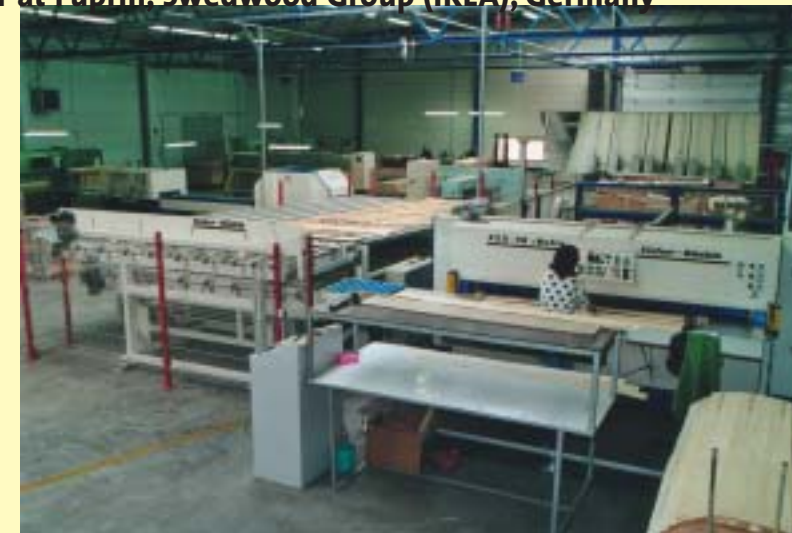
Crossfeed splicer at Fuprin, Swedwood Group (IKEA), Germany