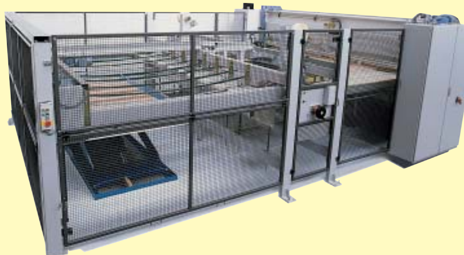
Modular system Crossmaster