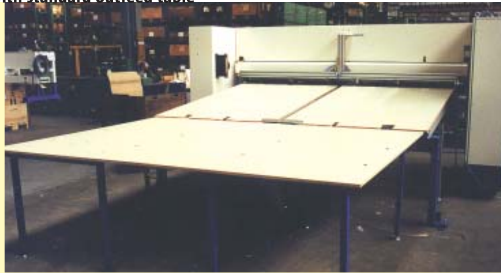
Basic machine with standard outfeed table